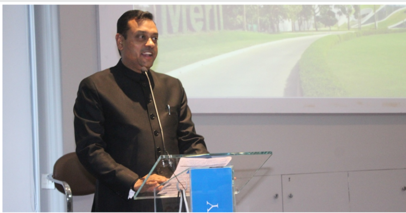
Dr. Sambit Patra