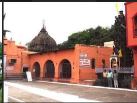
Parali Vajjanath Temple