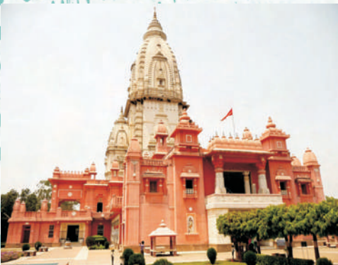
New Vishwanath Temple