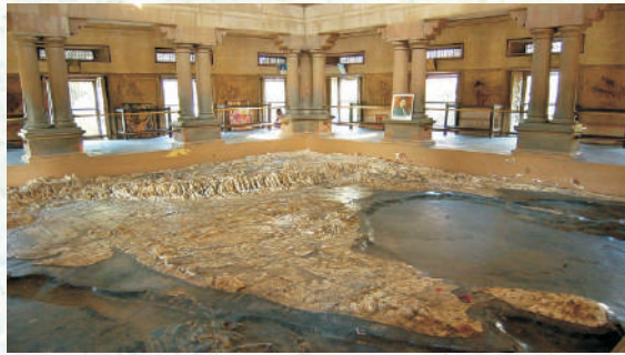
Bharat Mata Mandir