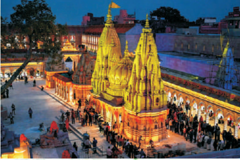
Kashi Vishwanath Corridor